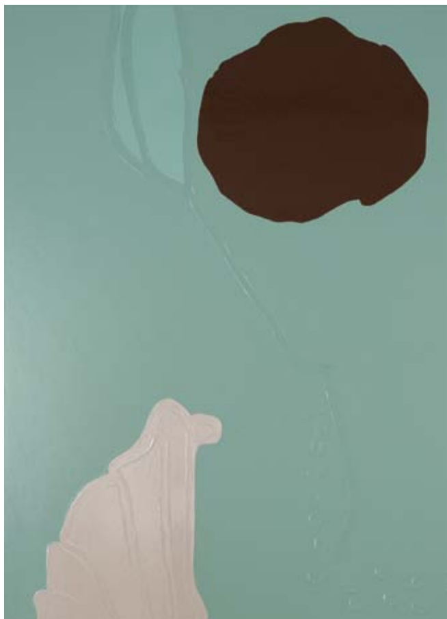
Gary Hume Keeping Mum 2015 gloss paint on aluminum 135 x 98 cm Courtesy the artist and Sprüth Magers