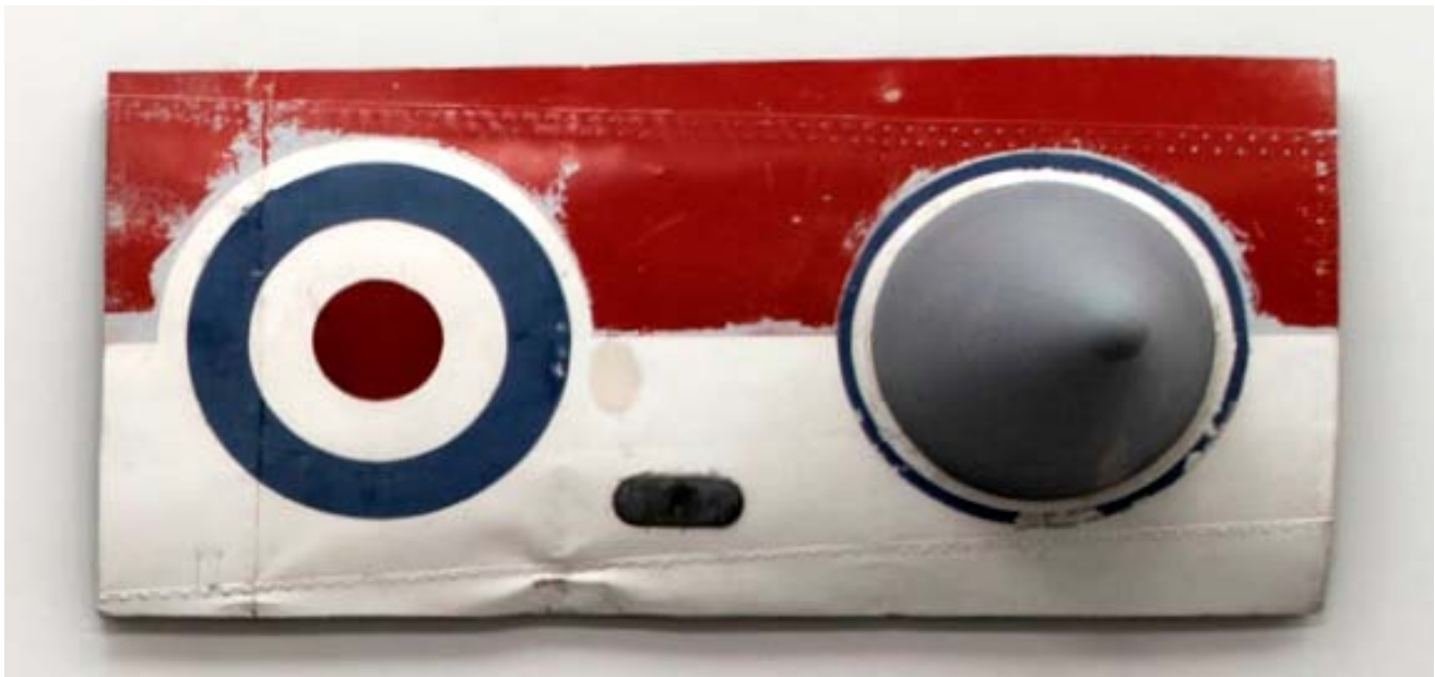
Fiona Banner Cat 2017 Provost plane, Jaguar tail section nose cone 61 x 143 x 70 cm Courtesy the artist and Galerie Barbara Thumm