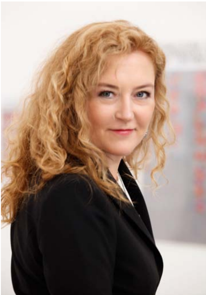
Barbara Thumm, Berlin 2017

We kindly request 2 copies to be sent to the gallery address.