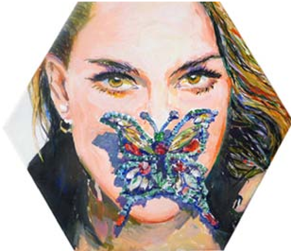
Elke Silvia Krystufek Butterfly (Travelling Light) 2016 ink on canvas 30 x 26 cm