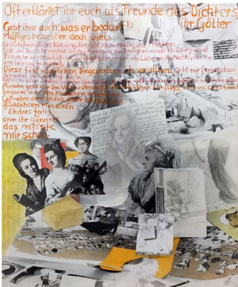
Anna Oppermann Objects of Contemplation on the Theme of Admiration – Reason: Goethe 1981 / 1984 photo emulsion on canvas, hand-colored 150 x 125 cm