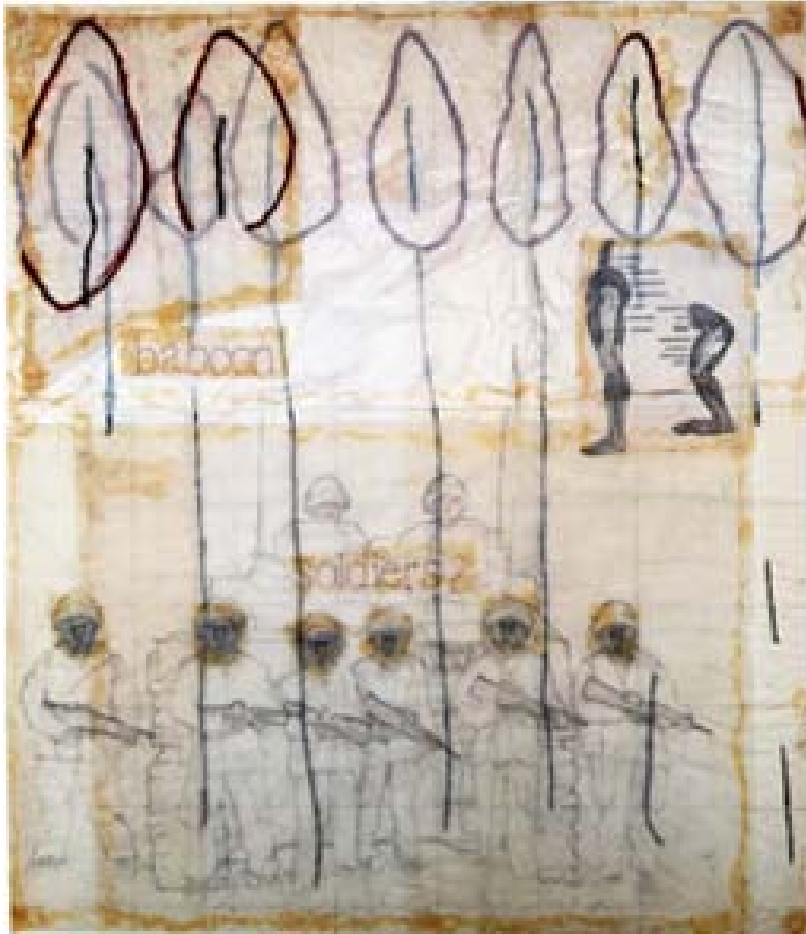
Jo Baer Baboon Soldiers 1990 70 x 60 cm mixed media