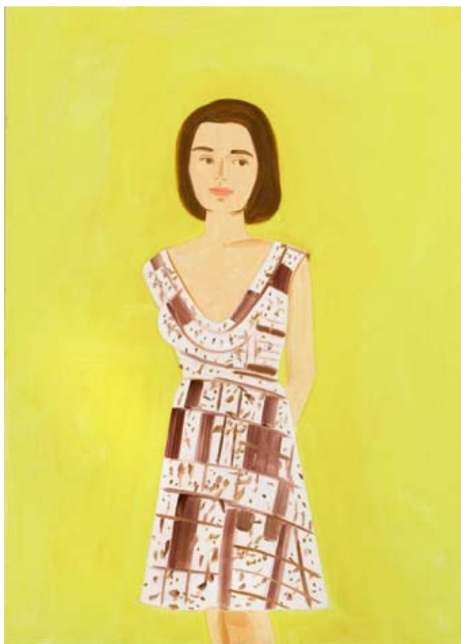
Alex Katz Vivien 2011 oil on canvas 167.6 x 121.9 cm